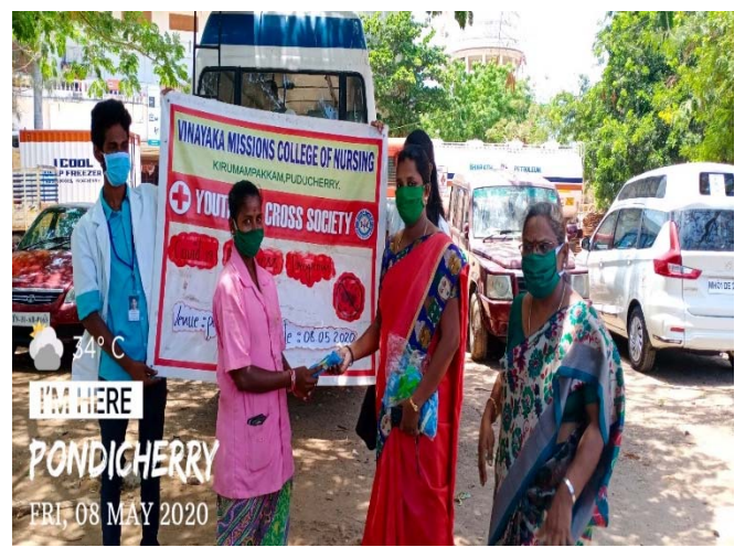
34° C I'M HERE PONDICHERRY FRI, 08 MAY 2020