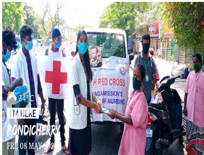
34° C I'M HERE PONDICHERRY FRI, 08 MAY 2020