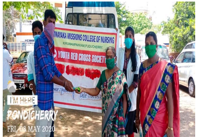
34° C I'M HERE PONDICHERRY FRI, 08 MAY 2020