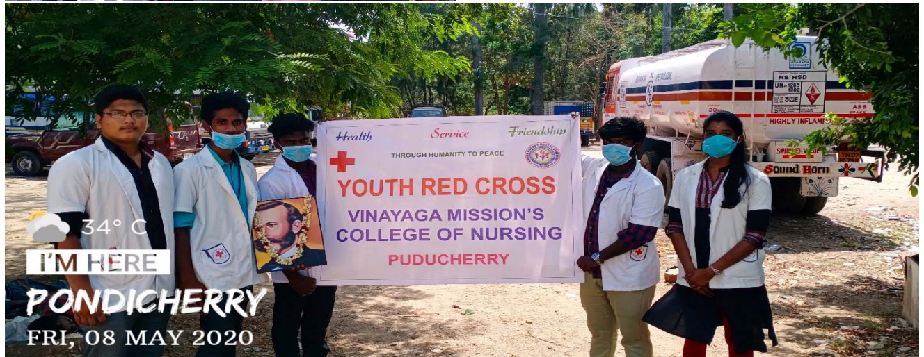
34° C I'M HERE PONDICHERRY FRI, 08 MAY 2020