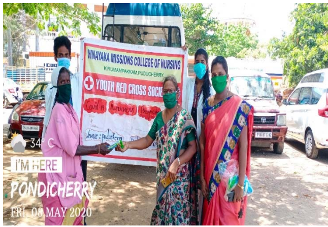
34° C I'M HERE PONDICHERRY FRI, 08 MAY 2020